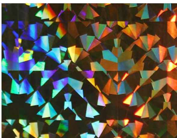
Hot stamping foil without shim line